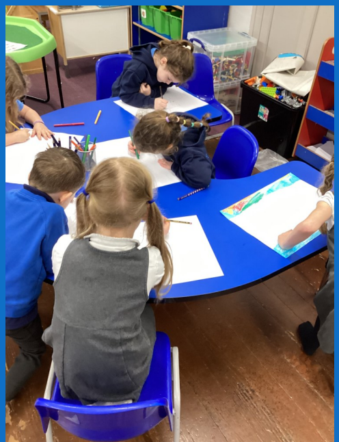
Story Crafters - 10 Little...