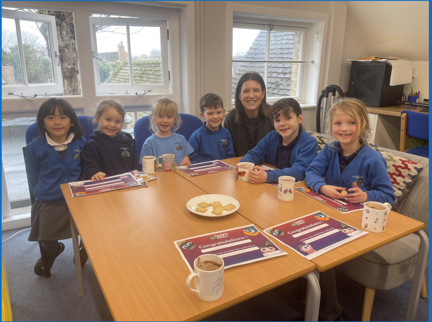
Boom Reader hot chocolate