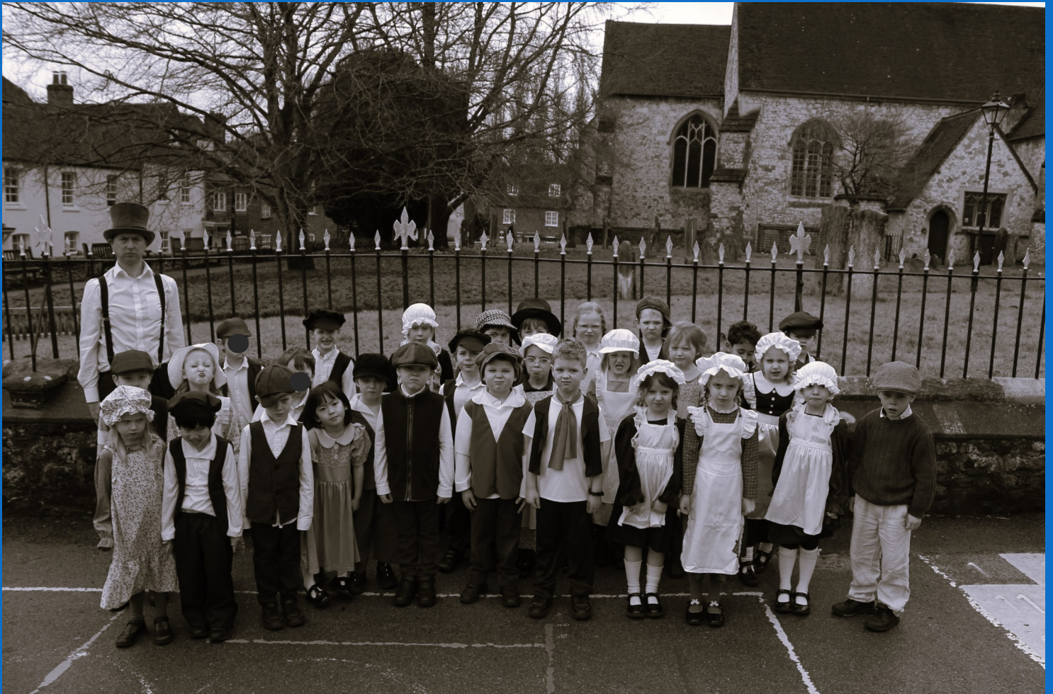
Butterfly Class Assembly - 'The Victorians'