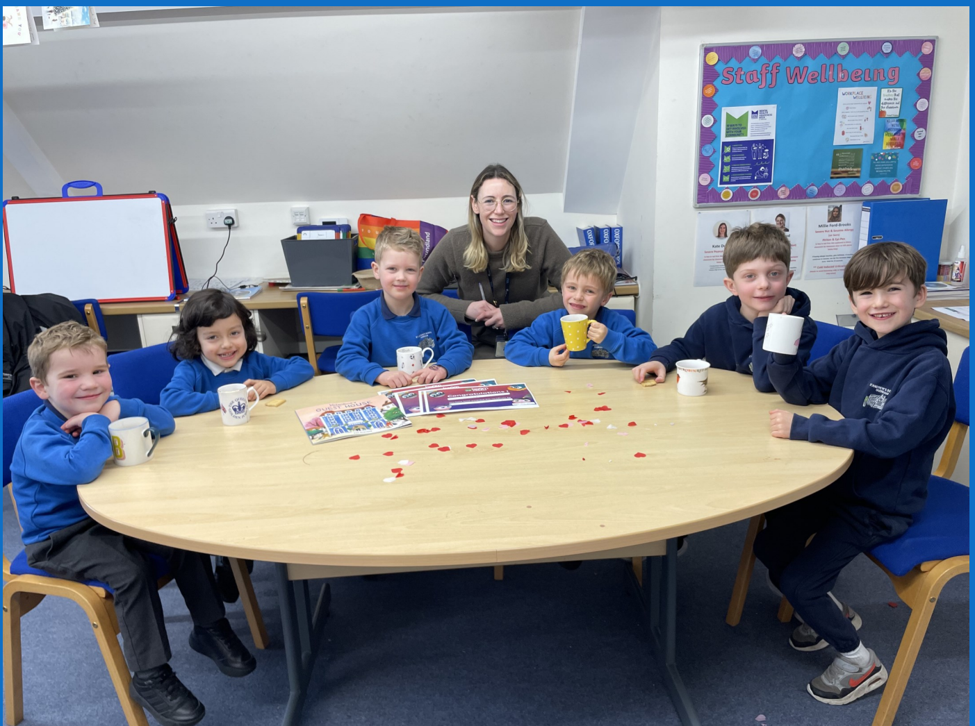
Boom Readers hot chocolate